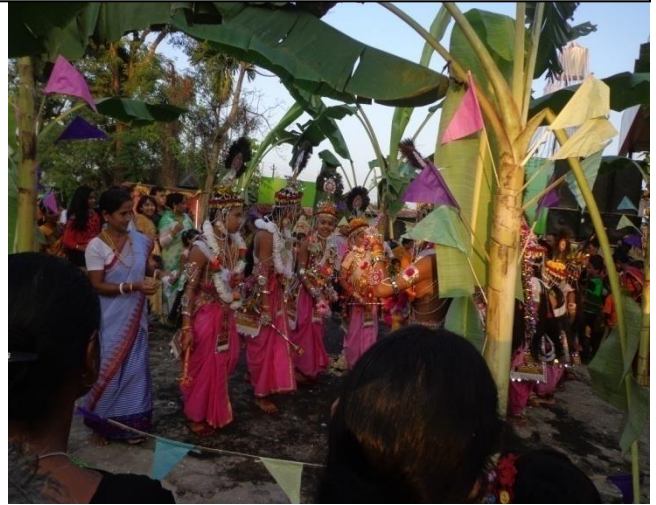
14. The Rakhal Dance of Bishnupriya Manipuri, Lord Srikrishna with the Gopals on 23 Nov 2018