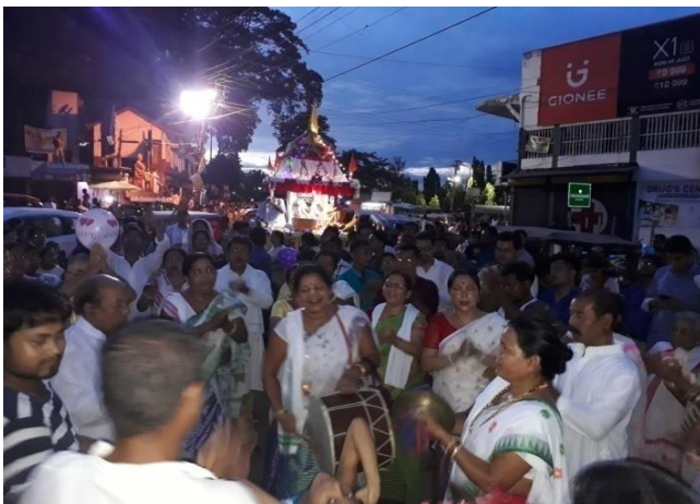
5. The traditional Rathajatra procession is progressing on 12 Aug 2018 at Dharmanagar