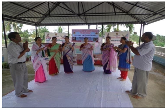
22. The Cultural Institute & Research Centre of Bishnupriya Manipuri, established by SCSBM is for regular training and cultural activities .