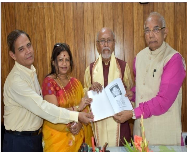
11. Memorandum on anomaly in previous Census Reports on Population of Bishnupriya Manipuri (BM) submitted to HE the Governor of Tripura