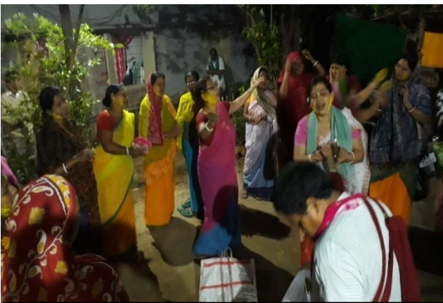
21. Traditional Holi Utshav being celebrated by ladies of Bishnupriya Manipuri spreading the message of love and friendship on 22 Mar 19