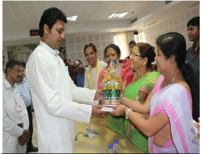
2. Traditional Doll to Sri Biplab Kumar Deb the New CM of Tripura on 06 Apr 2019