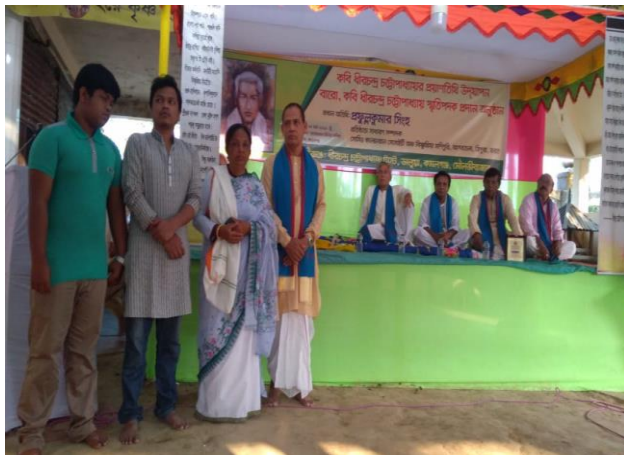
23. Secretary SCSBM in a function as Chief Guest at kamalganj in the Republic of Banglades on 14 March 2019