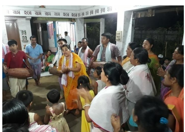
6. The traditional Joydev Pala of Bishnupriya Manipuri on the occasion of Rathajatra