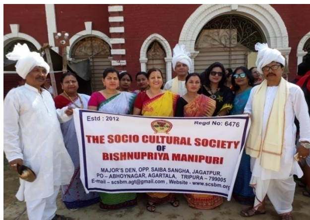
17. Mother Tongue Day observed, participating in Central Rally organized at Agartala by the Government of Tripura on 21 Feb 19