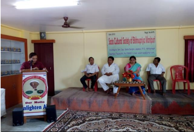
7. The General Meeting of SCSBM on 23 Sep 18 is in progress