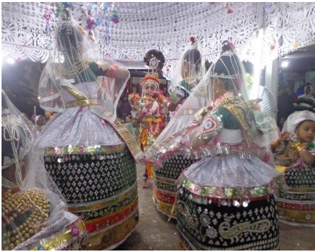
13. Traditional Raash Leela of Bishnupriya Manipuri, Lord Srikrishna with the Gopies