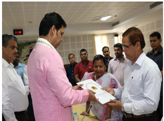
4 The Application for land for Community Centre of BM at Agartala being Submitted