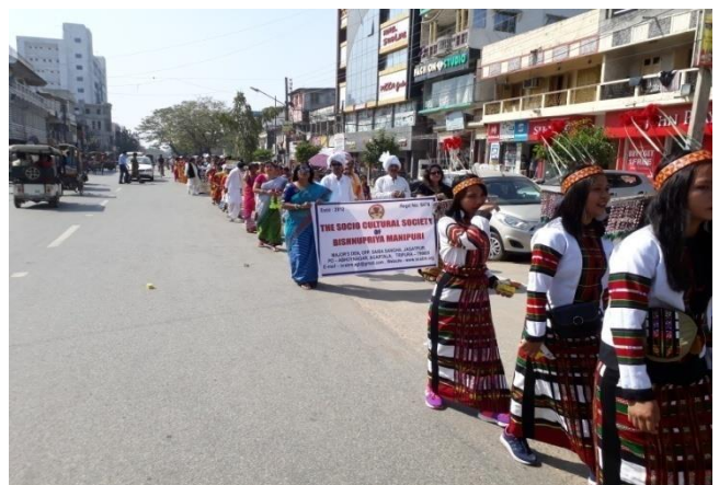
18. Contingent of SCSBM on Matri Bhasha Divas Procession, at Agartala representing Bishnupriya Manipuri language on 21 Feb 2019