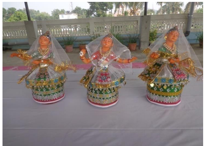
16. The indigenously made Traditional Doll of SCSBM