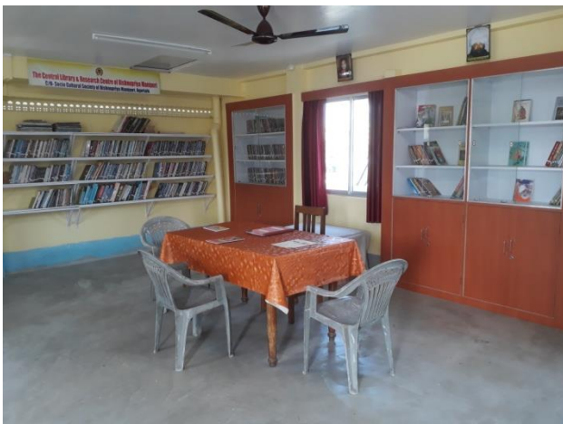
15. The Central Library & Research Centre of Bishnupriya Manipuri, an initiative of SCSBM