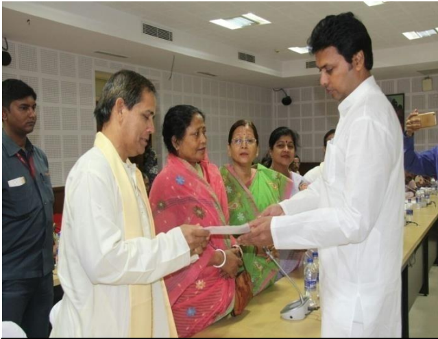
1. Letter of Congratulation to Sri Biplab Kumar Deb the New CM of Tripura on 06 Apr 2019