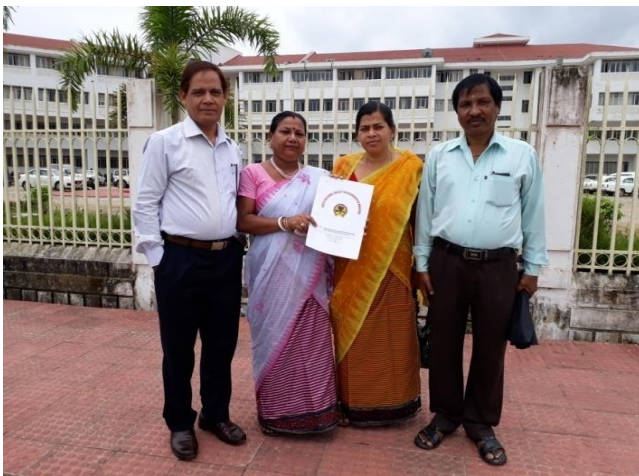
3 Team of SCSBM with the application for a piece of land for Community Centre at Agartala