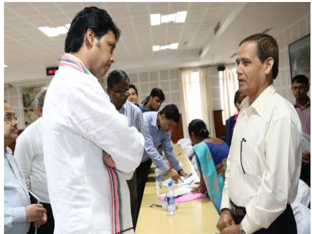
10. The case of Guru Bidya Sinha was heard by the Honorable CM of Tripura with keen interest